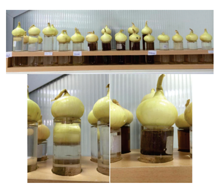
Figure 2. Experimental setting for root system growth

The A. cepa bulbs used in this research were commercially obtained. The experiment was performed according to a modified Fiskesjo's method (Fiskesjo 1985). A total of 110 A. cepa bulbs were used in this experiment. The old dried roots and dry surface scales were removed from each bulb. The bulbs were placed in vials filled with water samples from the appropriate sampling locations (10 vials for each location and 10 vials for negative control). Tap water was used as a negative control. Only the top of the base of the bulbs was in contact with the water surface (Figure 2). The vials were placed at room temperature (25 °C). Three collection series were made by cutting off the roots of each of the bulbs: first series