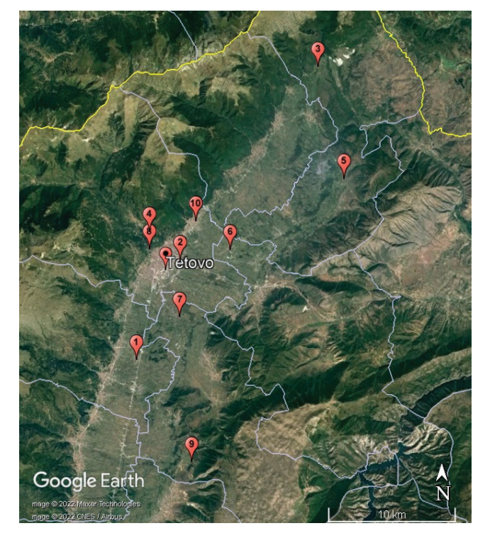
Figure 1. Locations of collection points for water samples in the Tetovo region 1) Dolno Sedlarce; 2) Tetovo railway station; 3) Vratnica; 4) Lavce; 5) Raotince; 6) Trebosh; 7) Brvenica; 8) Banjice; 9) Volkovija; 10) Dzhepciste