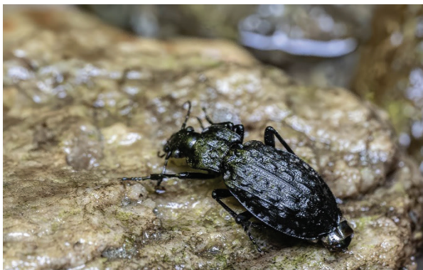
Figure 1. Carabus variolosus nodulosus Creutzer, 1799 (female specimen from Ljuboten, North Macedonia)

North Macedonia, Shar Planina Mt, tributary stream of Ljubotenska Reka (N42.170790°, E21.107261°), 1250 m a.s.l., stream in beech forest, traps, 16.06-03.09.2023, 1 female, leg. S. Hristovski & M. Komnenov (coll. S. Hristovski) (Fig. 1).